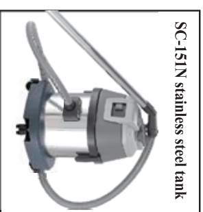
SC-151N stainless steel tank