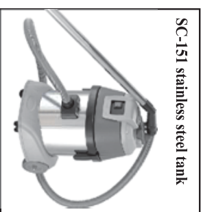
SC-151 stainless steel tank